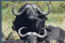
Arusha National Park