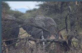
Tarangire National Park