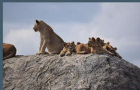
Serengeti National Park