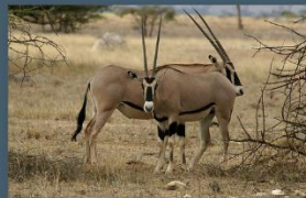
Mkomazi National Park