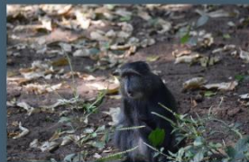
Manyara National Park